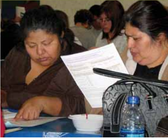
PARENTS SOLVE THE MYSTERY OF THE FINANCIAL AID FORM AT COLLEGE GOAL SUNDAY.

HEAD START IS A PROVEN METHOD OF GETTING CHILDREN READY TO SUCCEED IN SCHOOL... AND IMPROVING THEIR LIFE CHANCES FOREVER AFTER. Over 350 children, ages three to five, enrolled in CAAS Head Start's early education program this year. The program cares for them while their parents are at work and screens them for health and developmental problems. Head Start nurtures children's curiosity and desire to learn. Parents participate in governing the program through the Head Start Policy Council . Through courses in Exploring Parenting and English for Speakers of Other Languages, parents educate themselves and gain the skills and confidence they need to help their children learn.