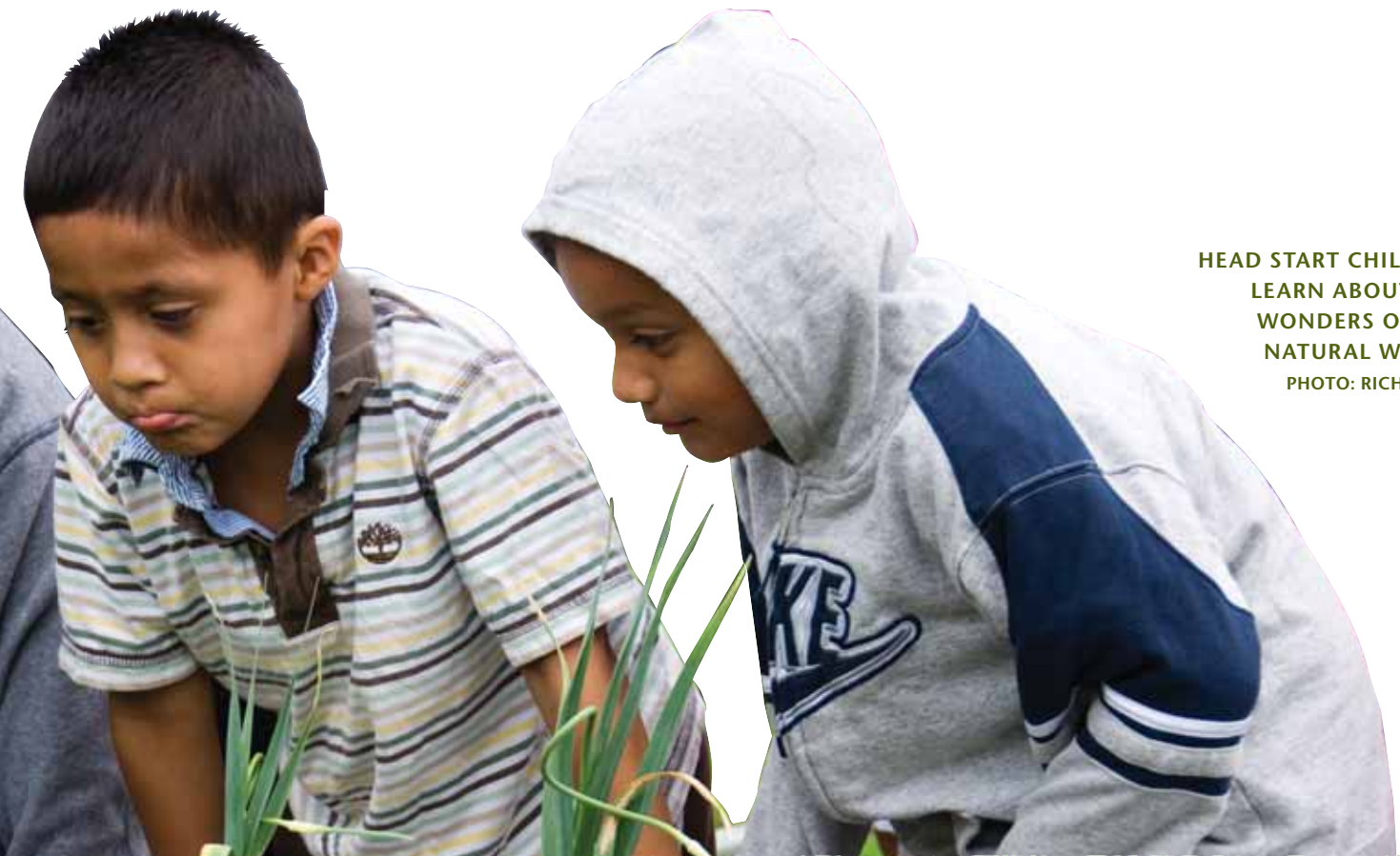
HEAD START CHILDREN LEARN ABOUT THE WONDERS OF THE NATURAL WORLD

Over 350 children enrolled in CAAS Head Start's early education program this year.