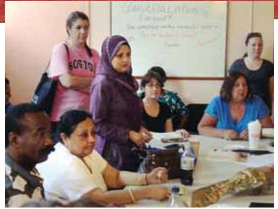
CAAS HEAD START TRAINS PARENTS FROM MANY NATIONS AND CULTURES TO BECOME SKILLED CLASSROOM TEACHERS.

In good times and bad, one path out of poverty has been employment in CAAS' Head Start program. Over half of the employees in the program, including the Head Start Director, began as parent volunteers. CAAS continues to train volunteers to become substitute teachers in our eighteen Head Start classrooms. Many of them go on to obtain certification and even college degrees and climb the career ladder in early education. A parent seeking child care may end up getting a lifelong career.